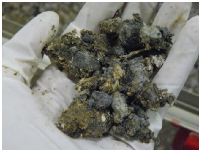
Figure 2. Appearance of the material at the end of the experiment. Color version available in online PDF.

In general, this work suggests that the studied paper residue could be an acceptable bedding material for